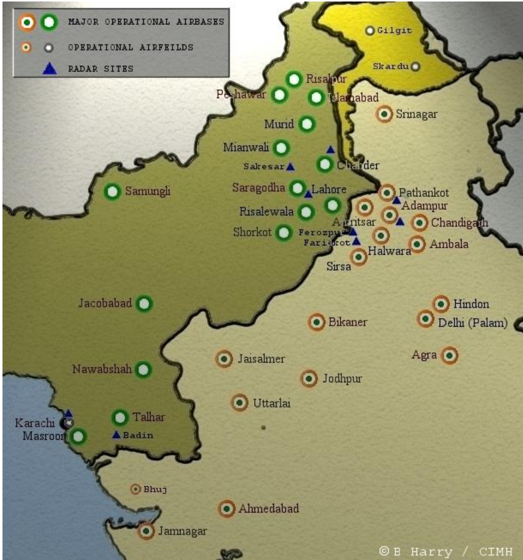
MAP 1.1 - IAF and PAF Deployments in the Western Theatre, Dec1971