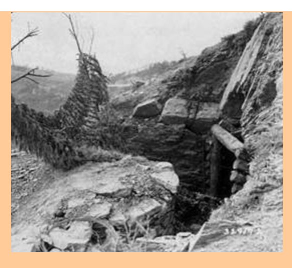
AN EXAMPLE OF A BEAUTIFULLY CONSTRUCTED GERMAN CAMOFLAGED BUNKER

http://www.army.mil/cmh-pg/brochures/nap/72-34.htm