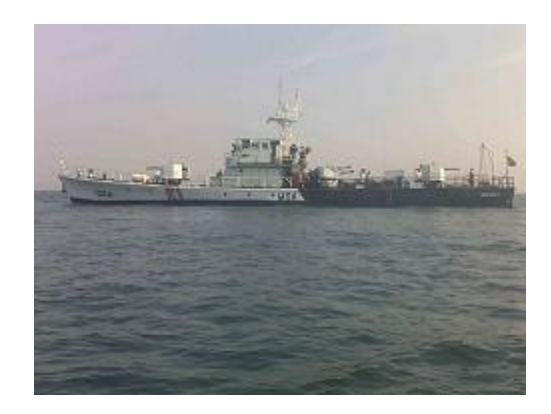
Fast Response Boat: